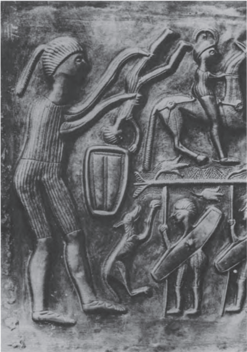
Figure 1.7 Sacrificial drowning, graphically depicted on the silver cauldron from Gundestrup (see p. 21).