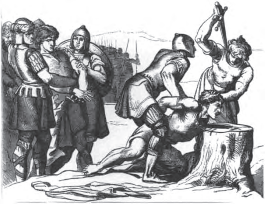
Figure 1.4 Charlemagne's method of converting the Saxons