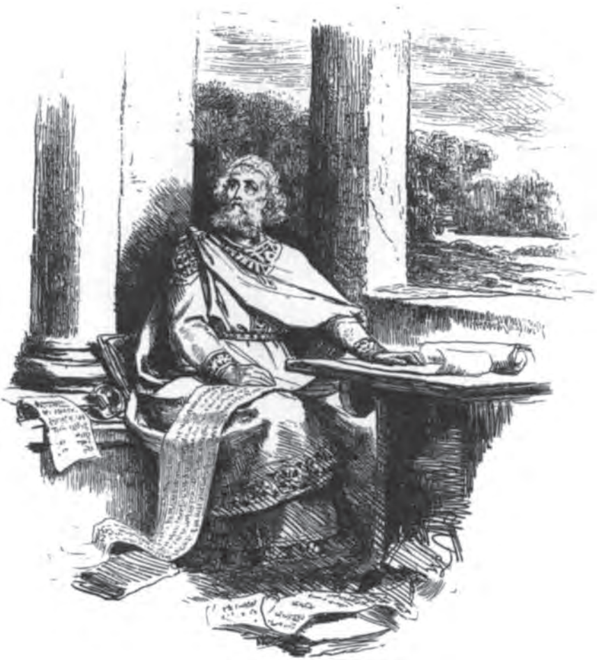
Figure 1.5 Ulfila translating the Bible into Gothic

Christian in 864 thanks to Cyril. Cyril's brother Methodius lived longer but was affected by conflict with Germanic bishops in Moravia (part of the Czech Republic) and even today a dividing line can be seen in Europe between the Latin-alphabet west, e.g. Poland and Croatia, and the Cyrillic east, e.g. Russia, Bulgaria and Serbia. Russia would not fall to Christianity, as we have seen, till a century later when Prince Vladimir decided on it as a deliberate act of policy.