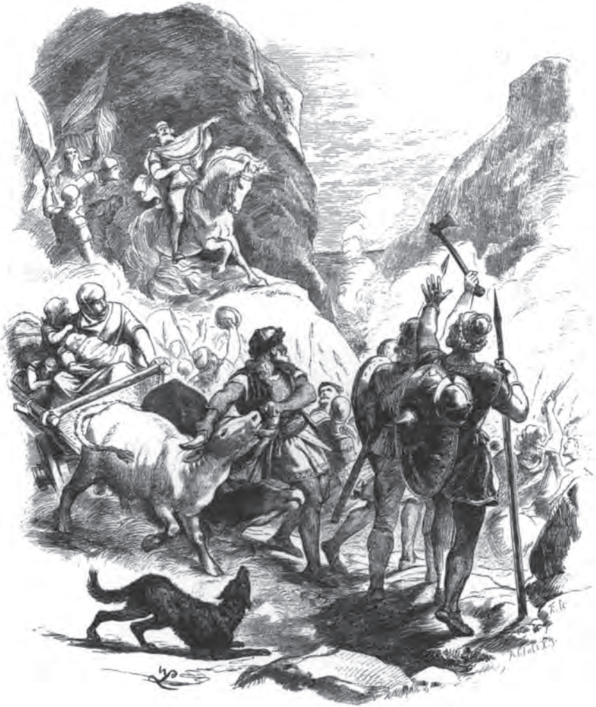
Figure 1.2 The Goths crossing the Alps into Italy

displayed cultural weakness in the face of urban civilisation and the lights of Empire were not switched off overnight.