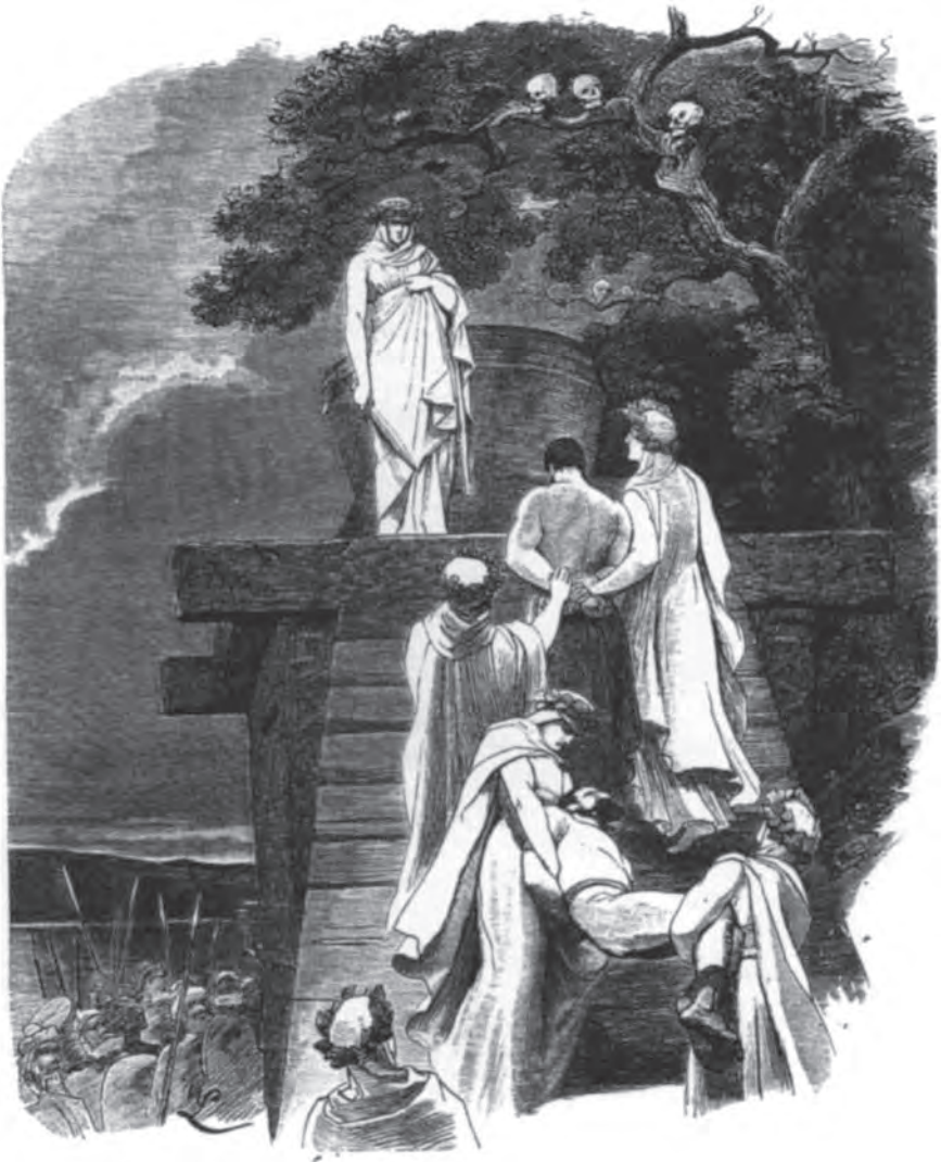
Figure 1.6 Priestesses and human sacrifice among the Cimbri

(Strabo 4.4.5)). So it looks as though he got beyond the Greek comfort of the Languedoc and Provence, though scholars debate how far. 38 Other fragments which it is harder to place in his output tell us about religion. For instance, he talks about the Cimbri, a tribe who despite their apparently Celtic name are said to be German 39 and who are best known for their invasion of Italy in 101 BC. Here, he seems to have mentioned ‘grey-haired divining priestesses dressed in white, with buckled cloaks of flax and a brass belt, but barefoot’: