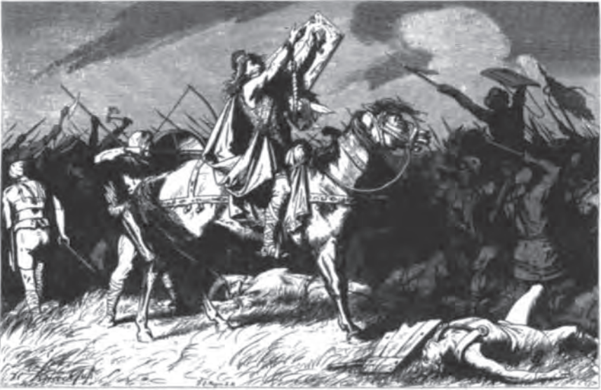
Figure 1.3 Clovis calls on the god of Clothilde